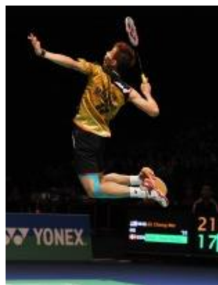
Figure 2: Forehand overhead jump smash (accessed on May 9, 2013 at http://badminton-coach.co.uk )